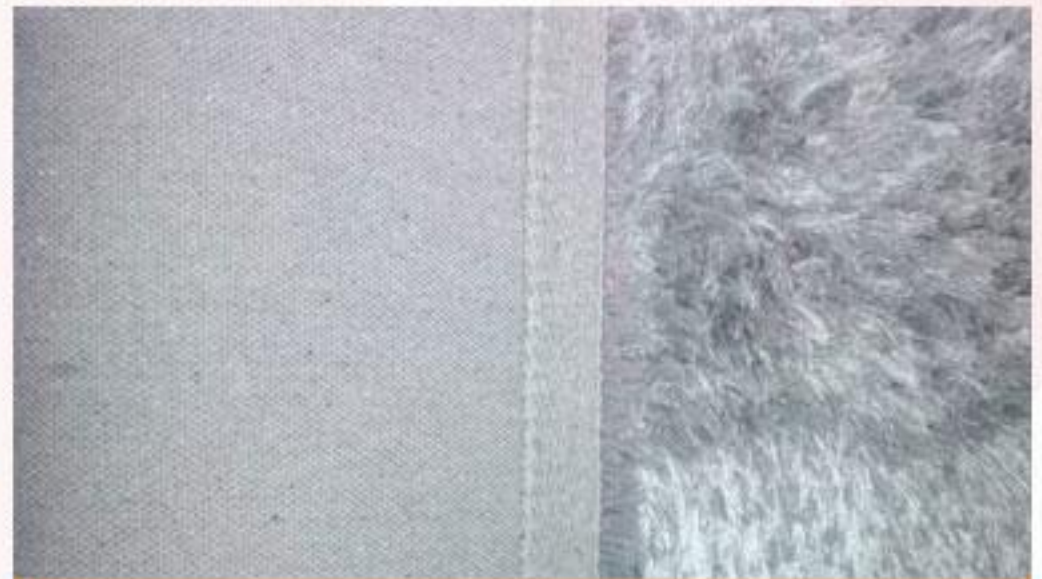
MICRO & SHAGG CARPET