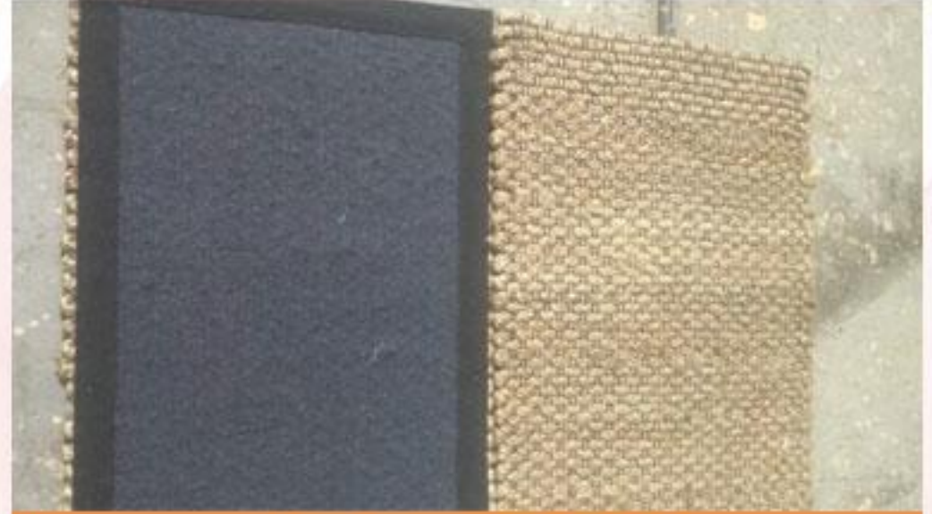
HAND TUFTED CARPET