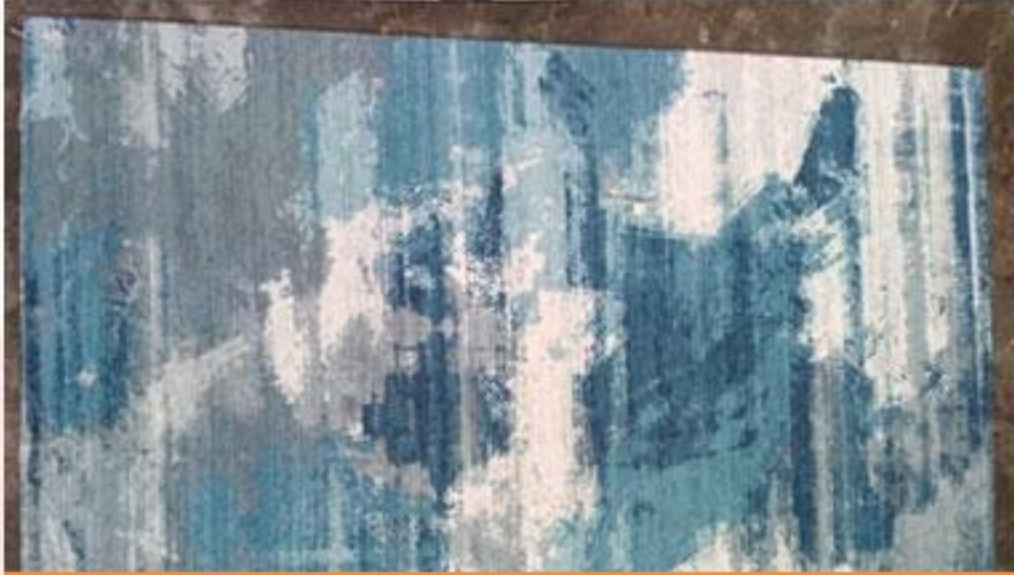
FANCY HAND TUFTED CARPET